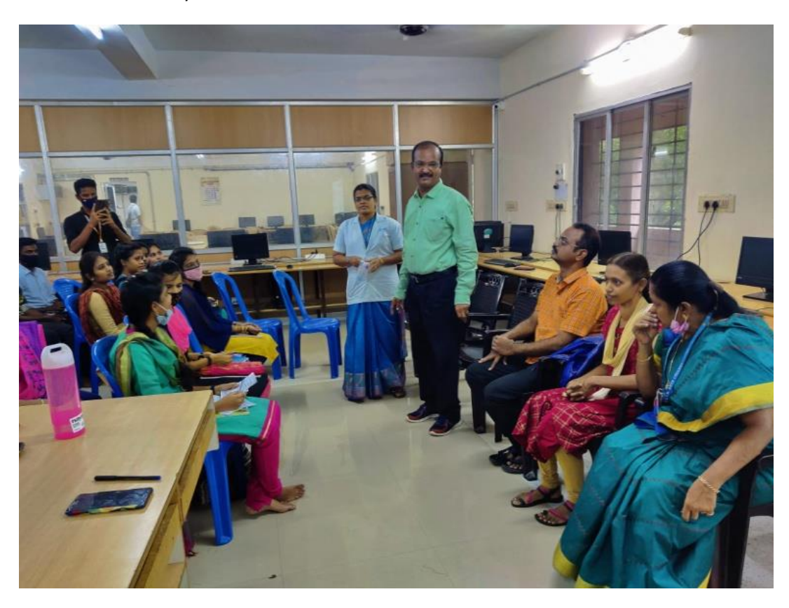
Chief Guest Honouring: